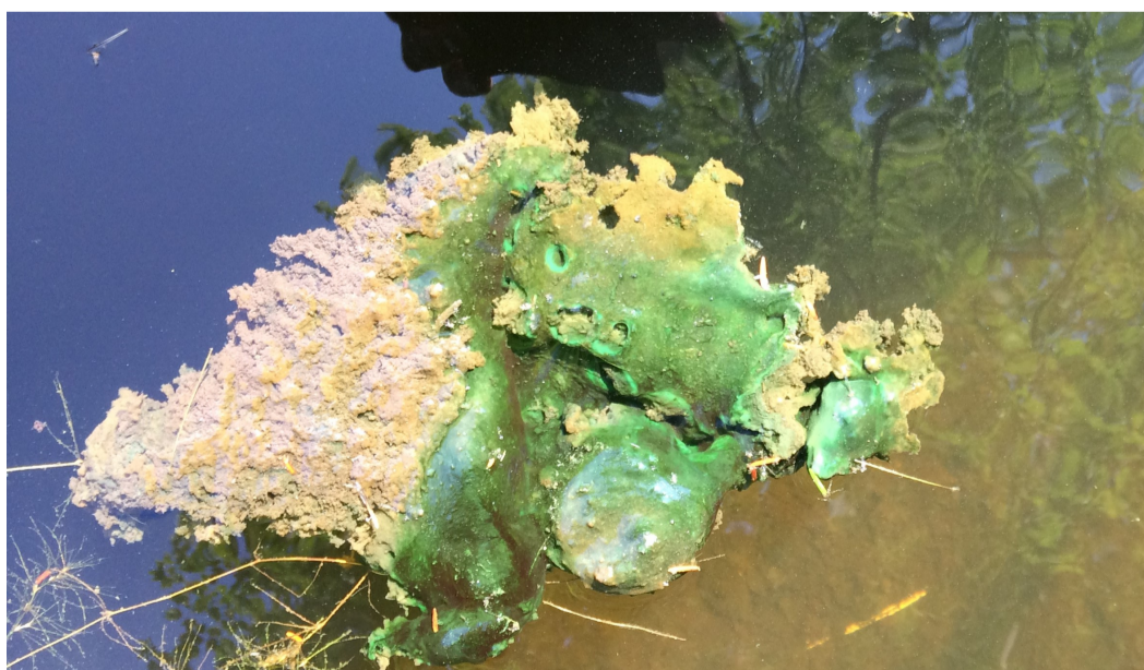
Floating globs or mats