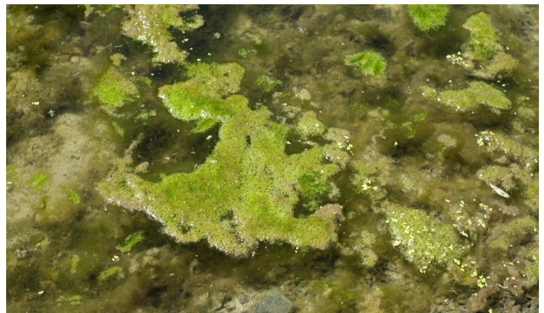
Long, hair-like filamentous green algae