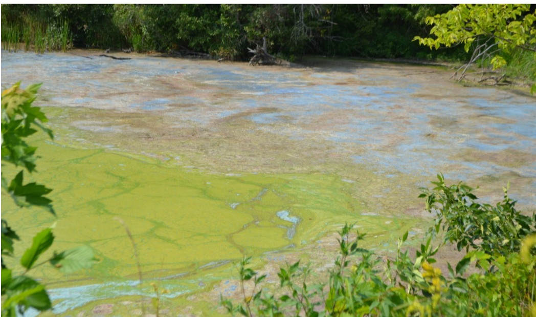
Surface scum that looks like spilled paint