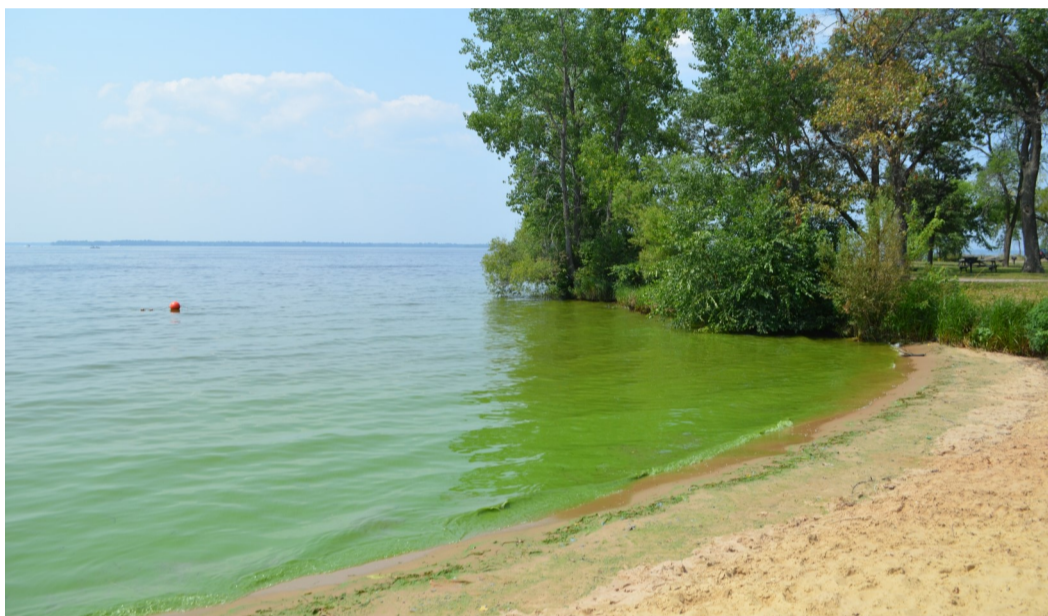
Green water that looks like pea soup