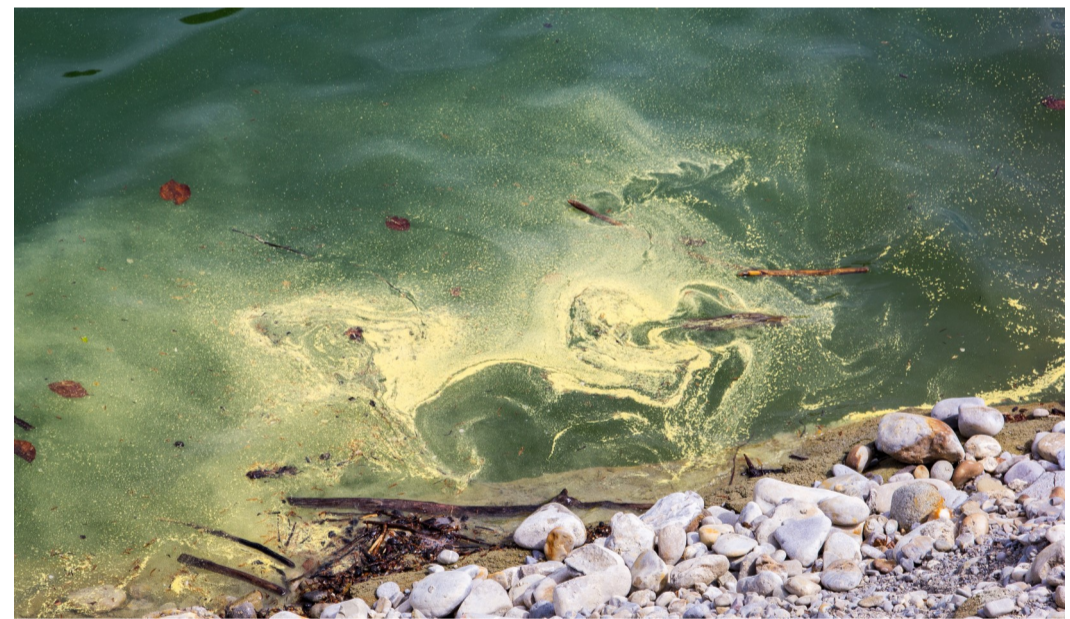
Yellow plant pollen